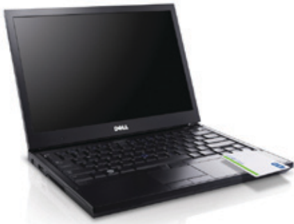
Dell® Latitude™ Laptop

With iCLASS-equipped laptops, implementing HID on the Desktop™ is so easy and cost-effective that IT managers will not think twice about implementing strong authentication